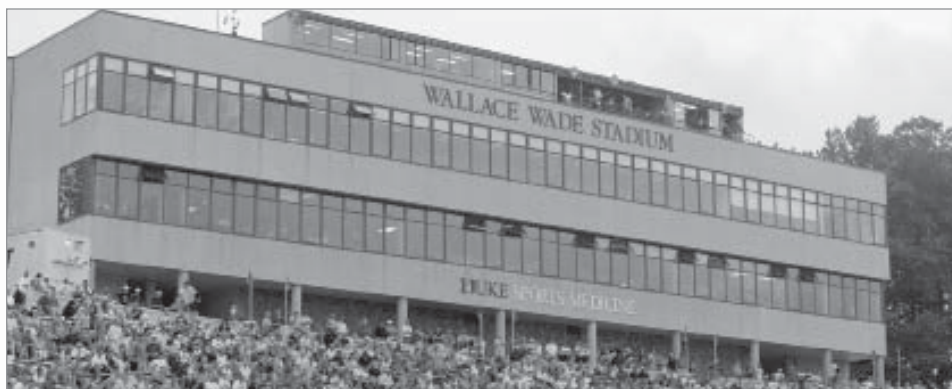
Ted Mann Press Box at Wallace Wade Stadium