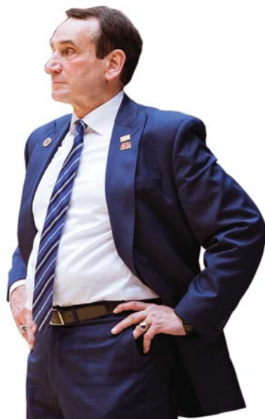
» Duke head coach Mike Krzyzewski enters the 2017-18 season two wins shy of becoming the first coach in Division I men's basketball history to win 1,000 games at one school.