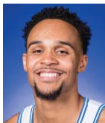
2 | Gary Trent, Jr. G | Fr. | 6-6 | 209 Columbus, Ohio