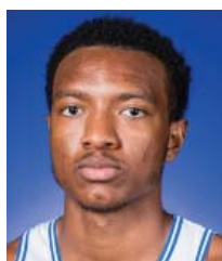
34 | Wendell Carter, Jr. F | Fr. | 6-10 | 259 Atlanta, Ga.