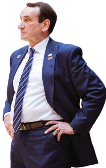
» Duke head coach Mike Krzyzewski enters tonight's game one win shy of becoming the first coach in Division I men's basketball history to win 1,000 games at one school.